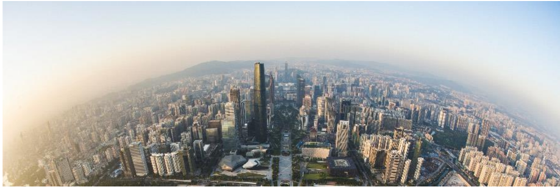
(One image of Guangzhou)