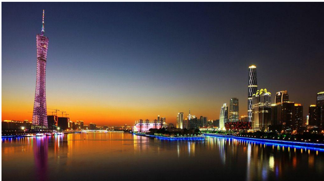
(One image of Guangzhou)